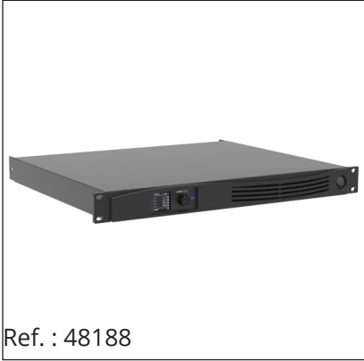
A-3004 SCiO 4 x 3000W amplifier with DSP